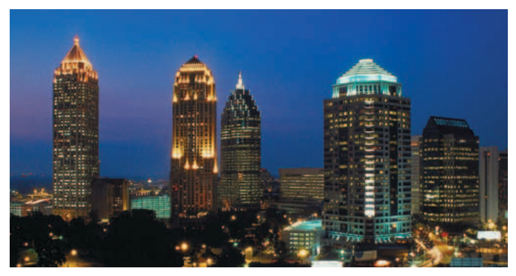
May 16–18, 2013, Intercontinental Buckhead, Atlanta, GA